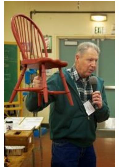
Windsor Box Back Chairs