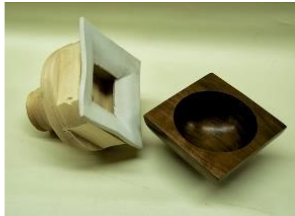
Mike Lanahan's square walnut bowl and square vacuum chuck