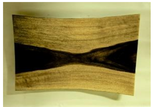
Brad Adams, rectangular sushi plate