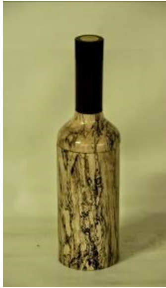
Bob Nolan, wine bottle pepper grinder