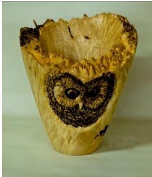
Ros Harper, vessel with a saw whet owl, a small owl native to North America.