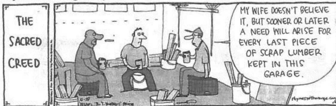
Rhymes With Orange Hilary B. Price