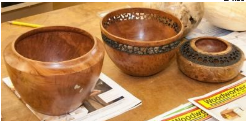
Three Redwood Burl Bowls by Larry Dubia