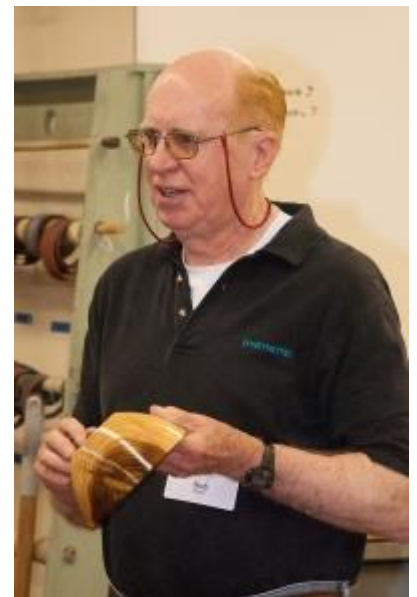
BBB—Bob Bean's Bowl