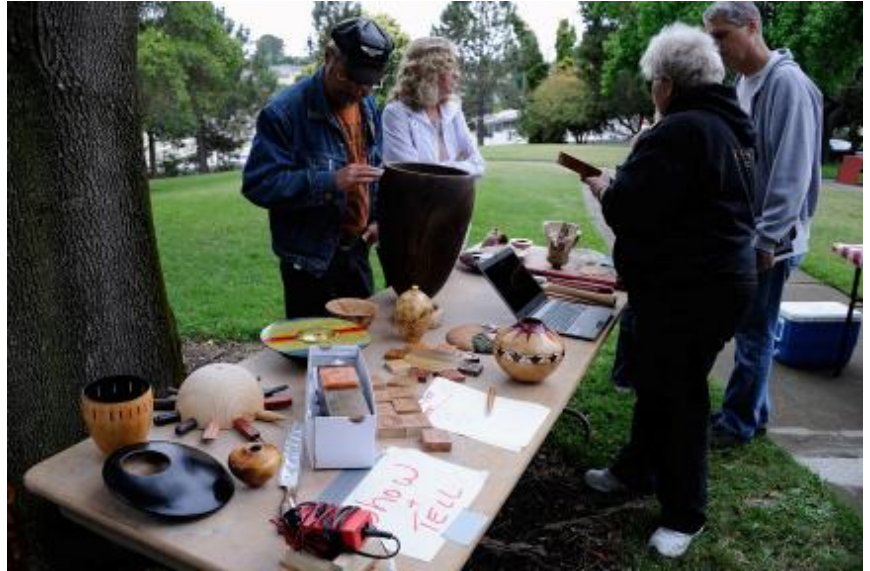
Show and Tell table at the Picnic