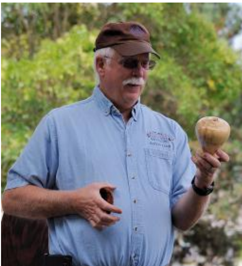
Thin wall bowl by Harvey Klein