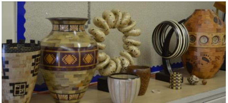
Techniques for all these objects and more were shared and discussed in detail

The library will not be open during the August meeting but will return on September. Save your return until September without penalty