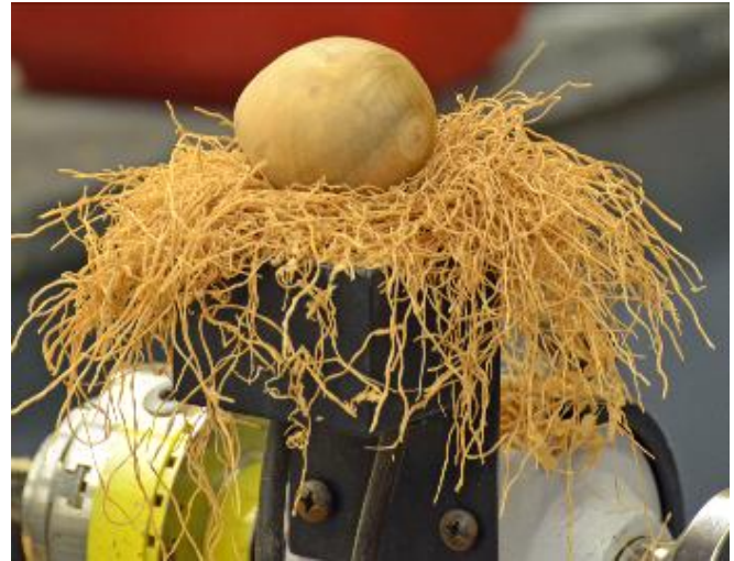
During one of the breaks “someone” practicing with their skew chisel laid an egg!