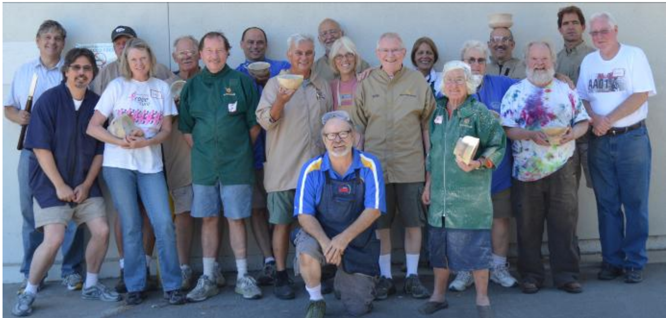
Please excuse our class dust