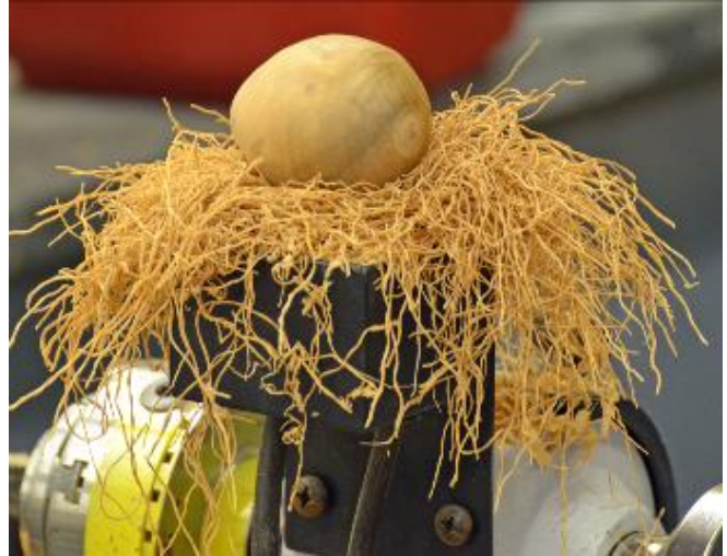
During one of the breaks “someone” practicing with their skew chisel laid an egg!