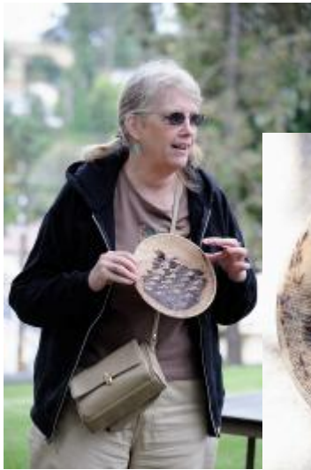
Michele Brooks pyrographed plate with a Escher style design