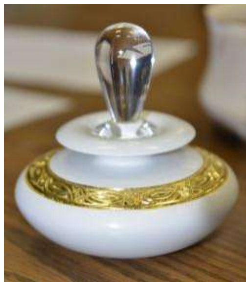
Hollow Form with Plexiglass Finial by Lanny Dana