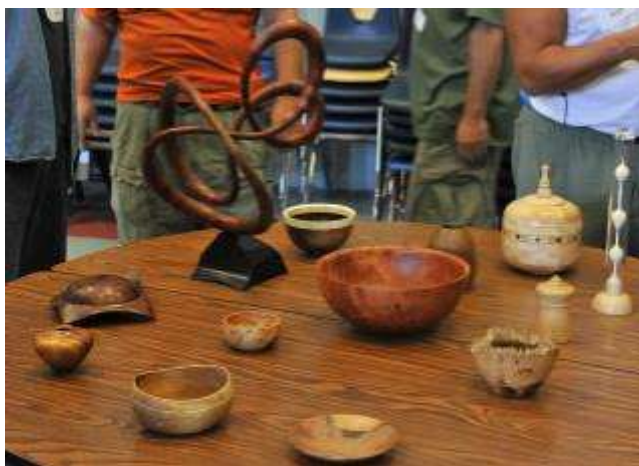
Show & Tell Table