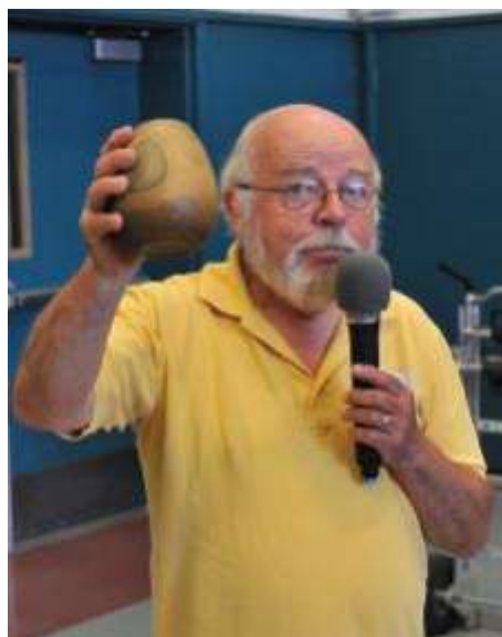
Jim Newport's Turned Vase