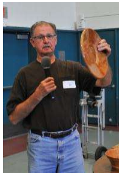
Segmented Platter by Don Gouviea