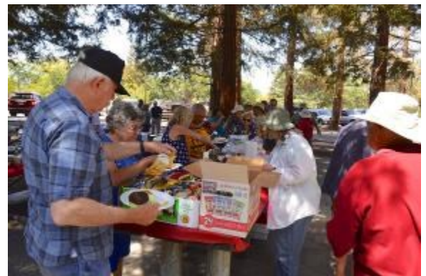
Plenty to eat for all!