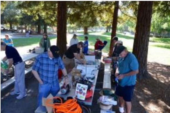
Bargain hunters find great buys!