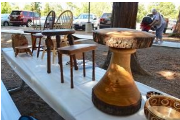
All the entries lined up for the judges' approval