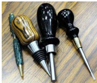
Some tool designs by Mike Bulat