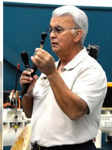
Some tool designs by Mike Bulat