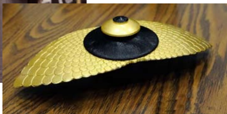
A beautiful gold-leafed Winged Box by Lanny Dana