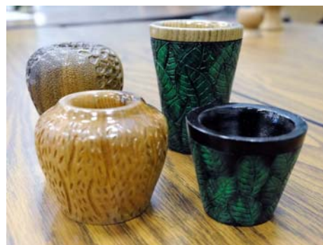
Four design ideas Jay Holland