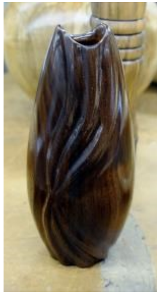
Carved Walnut Vase by Jay Holland