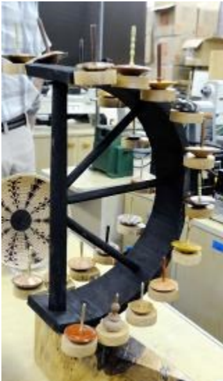
Top Display by Don White