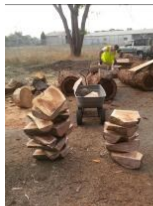
Carob Tree Crotch Preparation