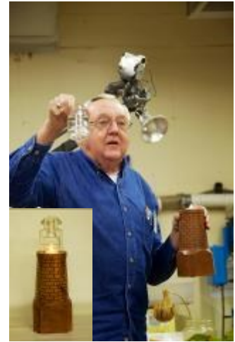
Jay Holland-Redwood Lighthouse