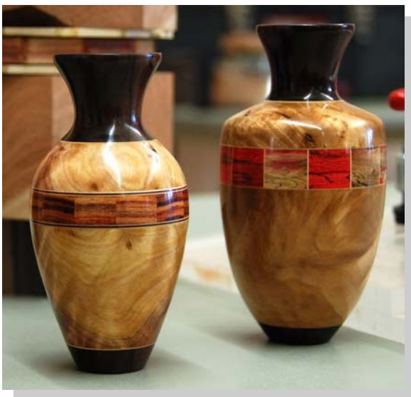
Examples of Jim's finished vessels.