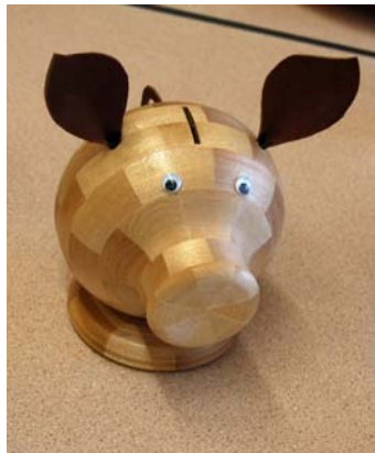
A cute segmented piggy bank by Lyle Burks