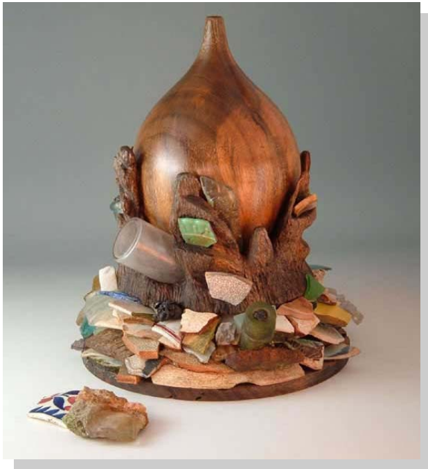
Rising (Again) Through Our Artifacts

Elizabeth had three turned items. A pierced work depicting a butterfly trapped in a web captured the viewers attention as the piece was moved, casting intriguing shadows. The following work was also accepted in the 2007 International Juried Exhibition of Woodturning in Portland, OR, with the theme "Turning Green".