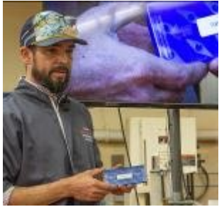
Bargain carbide blades