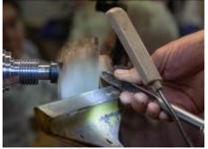
Working down to the wing