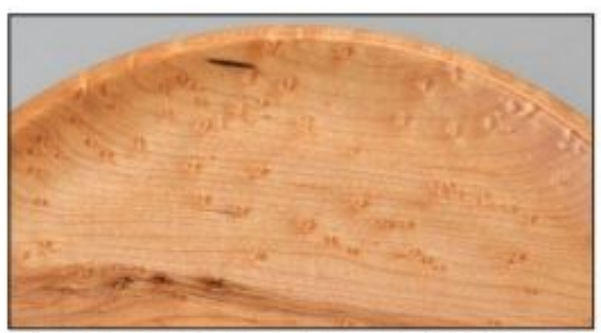
Birdseyes seem to be scattered at random and can show up anywhere.

I enjoy turning maple with dark heartwood and lighter sapwood for the contrast it gives. If the wood is the same color, I may paint the edge of the bowl or pierce it to add more interest. I have found that boxelder is a softer maple variety and can tear out when turned dry. The red flame of a boxelder will eventually fade in the light.