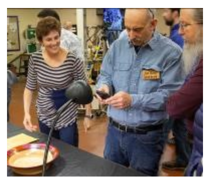
Examining Show & Tell items