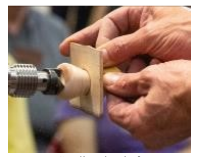
Sanding the shaft