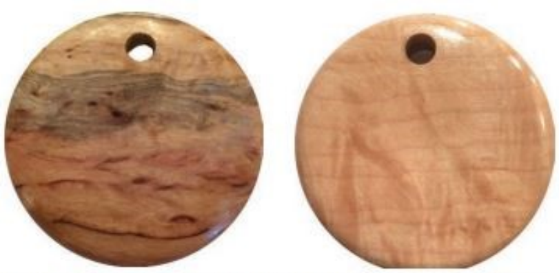
Color — Maple can be very colorful. Dave makes these pendants from bowl scrap.