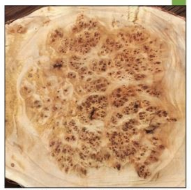
Burls may appear on any species of maple.

Ambrosia & Flame – Ambrosia maple and boxelder (flame) have colored streaks thanks to