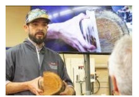
Dealing with pith