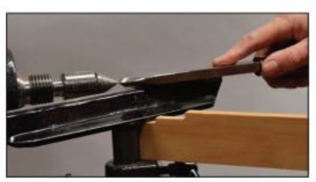
Step — The gauge step lowers the toolrest by the thickness of this scraper, positioning the edge at center height.

Woodturning FUNdamentals | February 2019