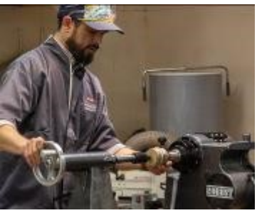
Mounting between centers