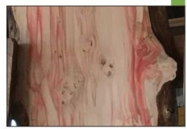
Flame — Red figure in boxelder eventually fades in the light.

I encourage everyone to search their local Craigslist "Free" category and keep an eye out for "Free wood" or "Free firewood," and contact the poster to ask them if it's maple. Always