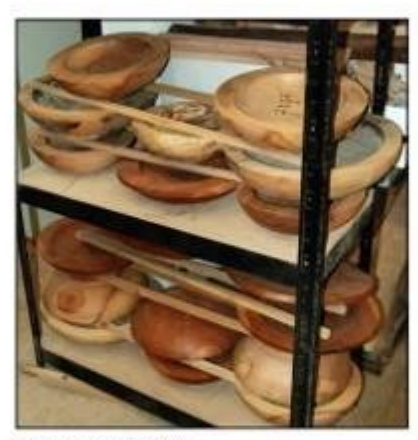
Drying rack for bowls

But what does that mean if you have cells shrinking on the outside, but cells still swollen on the inside? Wrap your hands around a hot dog and give it a good squeeze. Squeeze too hard and the hot dog smashes. The same thing can happen with wood.