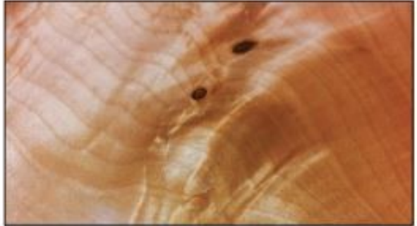
Figure in maple bowl by Dave Schell.