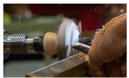
Roughing the other side