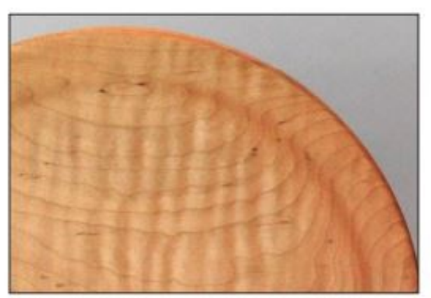
Curl runs at right-angles to the wood grain.