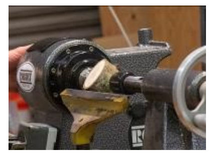
Marking new centers