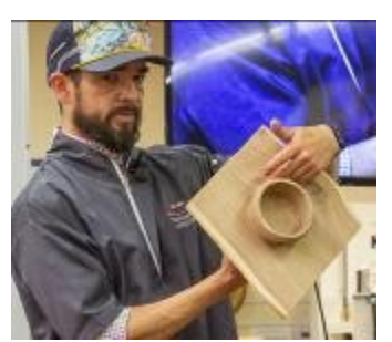
Proper direction for separating cut