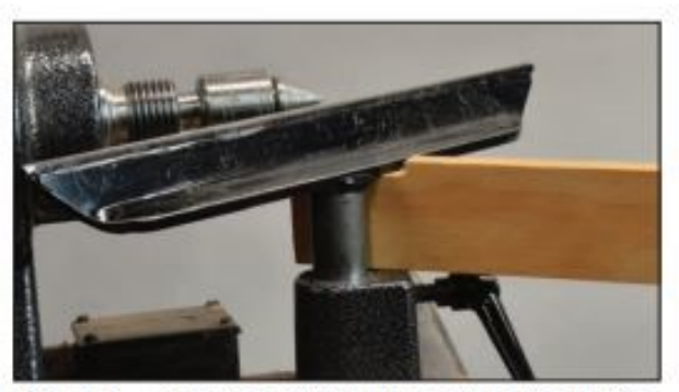
Gauge — The step gauge guarantees the rest is on center.