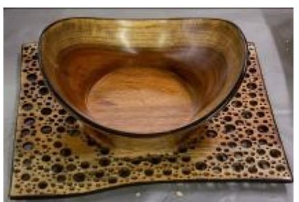
Pierced winged bowl