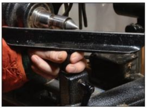
Fingers — Bring the rest up to a cone center, wrap fingers around the post, and learn how it feels. You'll quicky become able to judge center and the thickness of a tool below it.

That doesn't work for your arthritic gnarly-fat sausage fingers? Make a wooden step gauge, one step for center and a second step for 1/4" or so below, as in the photos.