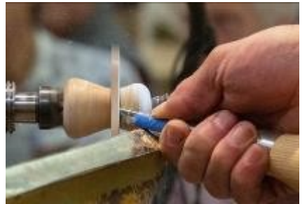
Undercutting the other side