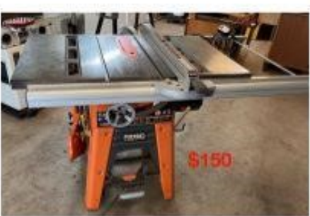
Ridgid 10 inch Table Saw (TS3650 Mobile)