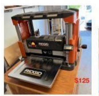
Ridgid 13 inch Planer with Wixley depth gage