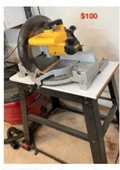
DeWalt 12 inch Compound Miter Saw (DW705)