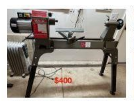
NOVA 1624/44 Wood Lathe