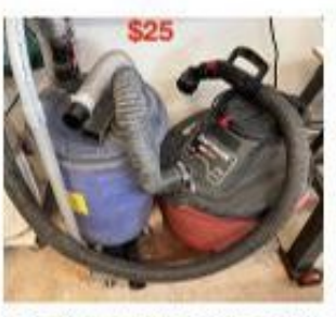
Craftsman Vacuum with Cyclone Bucket