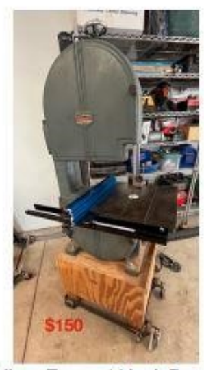
Walker -Turner 14 inch Bandsaw (BN905) with replacement motor, Krieg fence, and mobile base