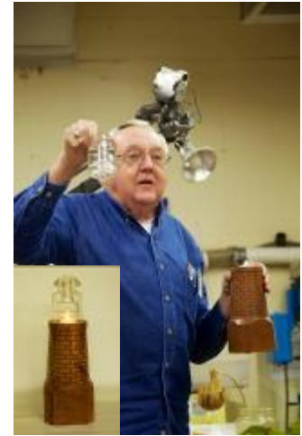
Jay Holland-Redwood Lighthouse